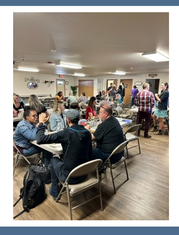
Drive Thru Flu Clinic